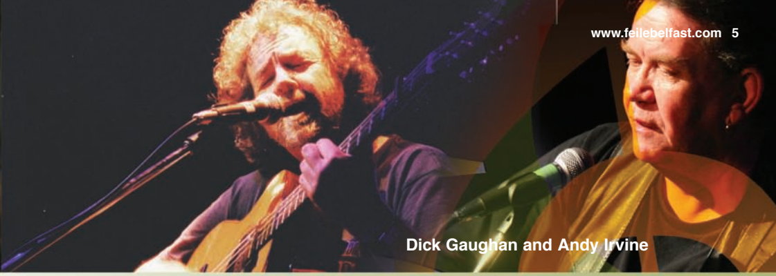
Dick Gaughan and Andy Irvine