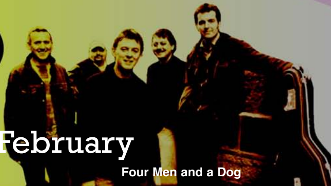
Four Men and a Dog